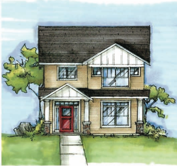
Plans and drawings are preliminary and are subject to change without notice. Artist rendering is for conceptual purposes only and may not be relied upon

1445 Total SQ.ft 923 Unfinished basement Beds: 2 Baths: 1 Two Story Two Car Garage Dining Room Family Room Recommended Finish: Classic Package